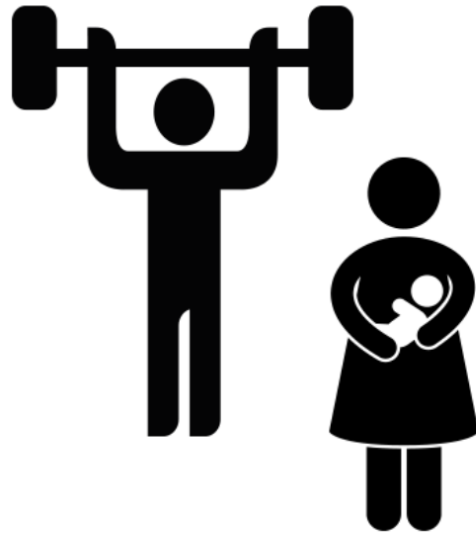
Slide 06. Gender roles