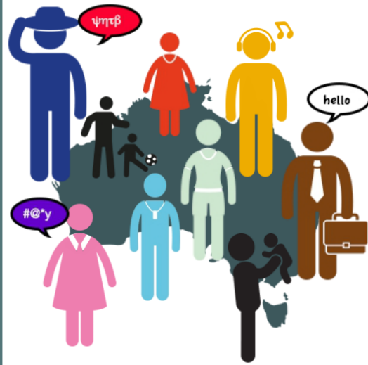
Slide 10. Multicultural country

This is because Australia is a multicultural country.