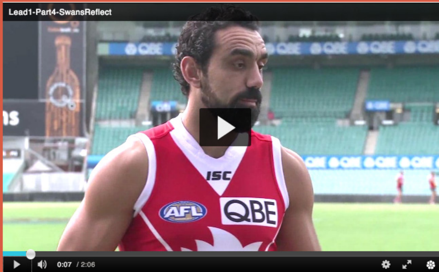
Slide 09. Video